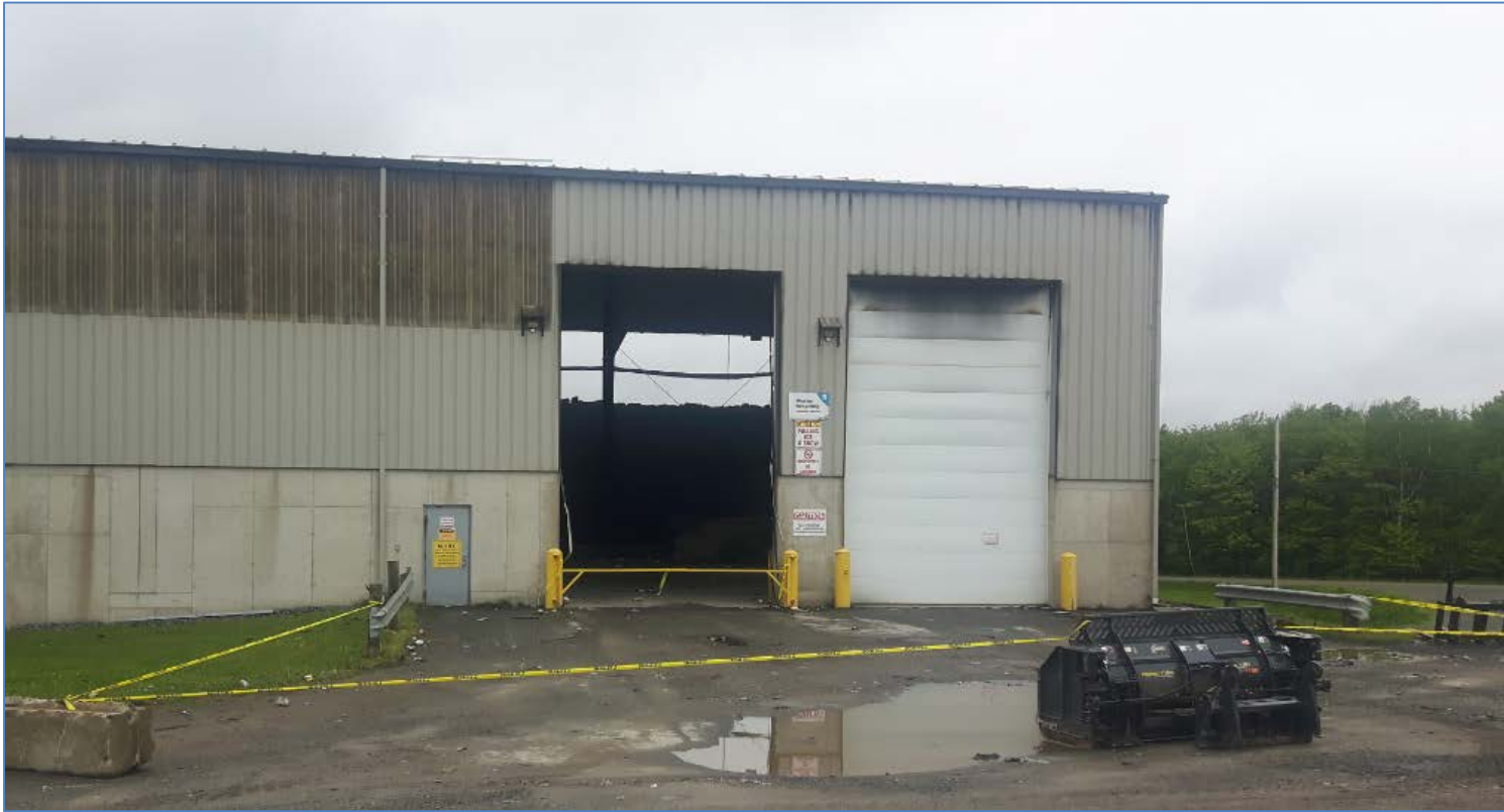
Transfer Station Blocked Off