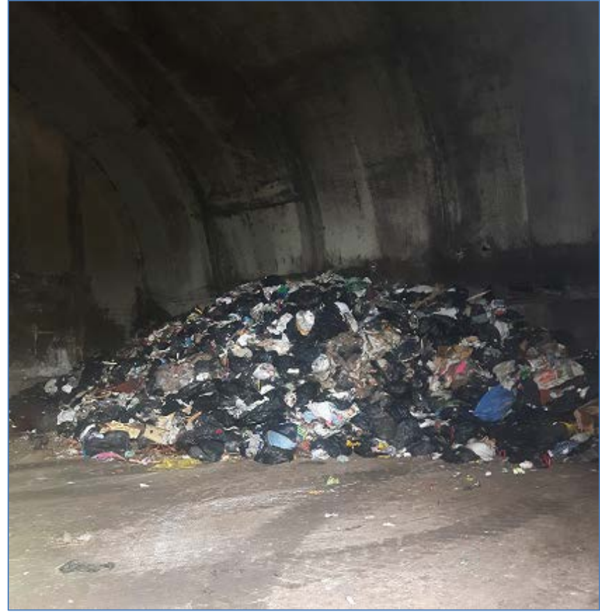
Left – Organics outside Organics Transfer Station Right – Garbage inside Organics Transfer Station