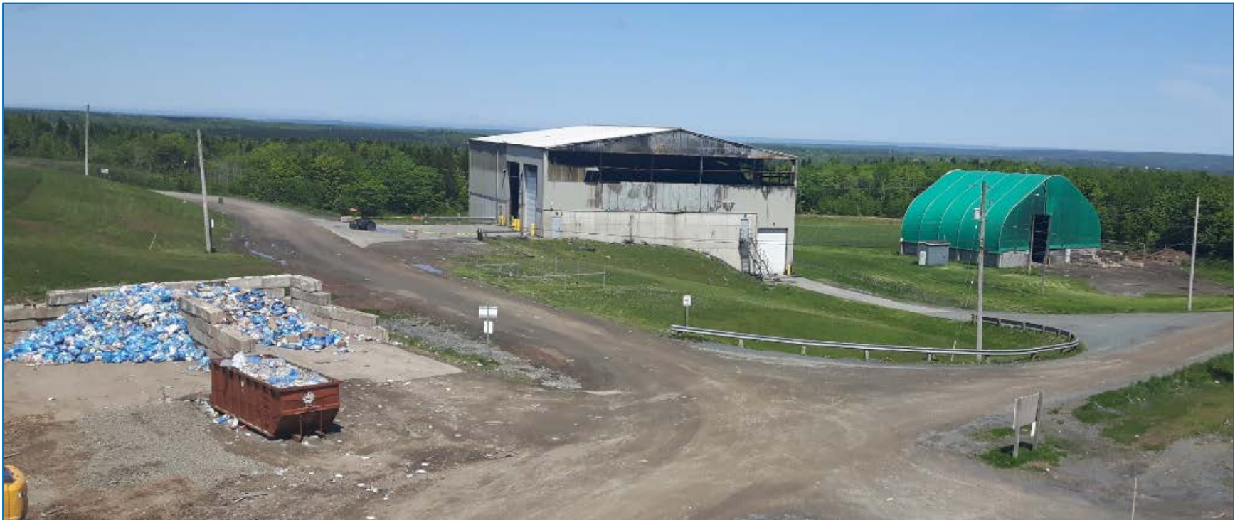
New operational setup view