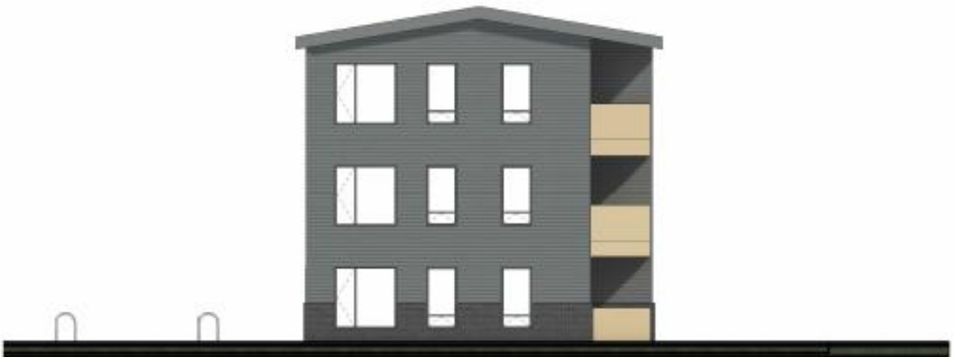
② Building A - North Elevation 1" = 10'-0"