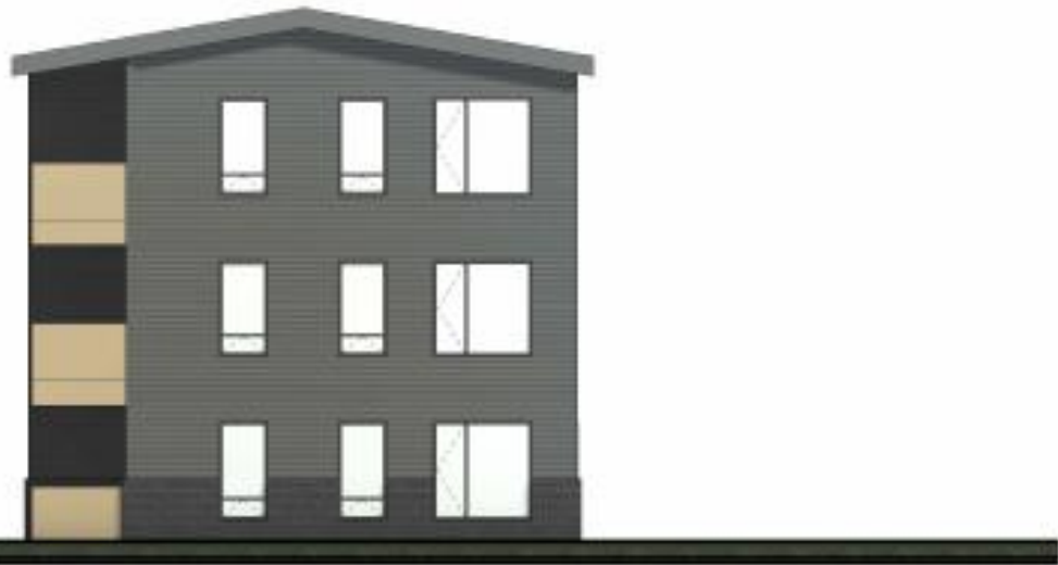
② Building A - South Elevation 1" = 10'-0"