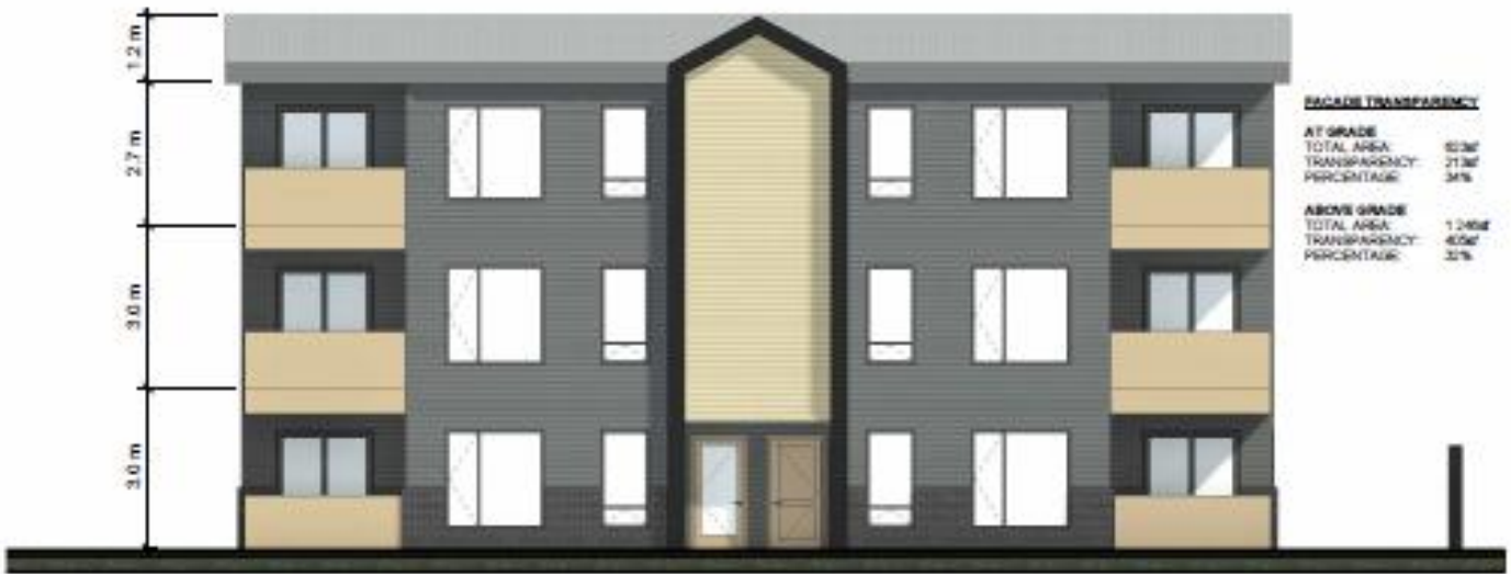
① Building A - West Elevation 1" = 10'-0"