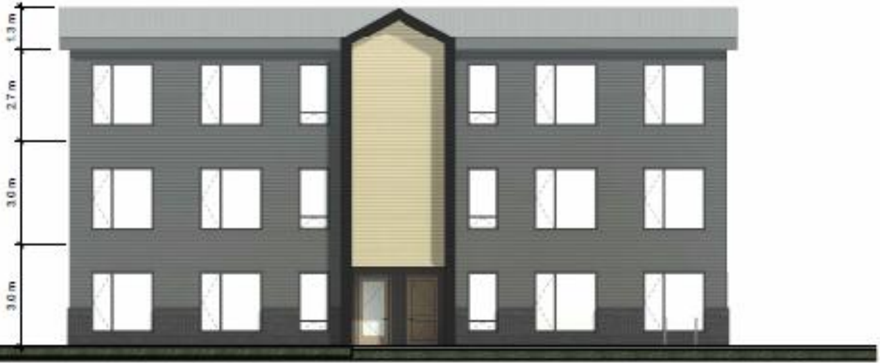
① Building A - East Elevation 1" = 10'-0"