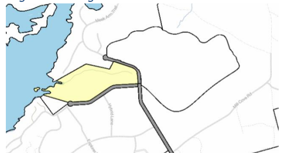
Image 1 - Existing Trails are Located on PID 45392578

In 2023, motion C23(380) authorized the CAO to enter into an agreement with the Trails Association for the operations and maintenance of trails on PID 45392578. The agreement was fully executed on May 7, 2024.