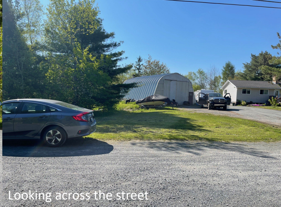
Looking across the street