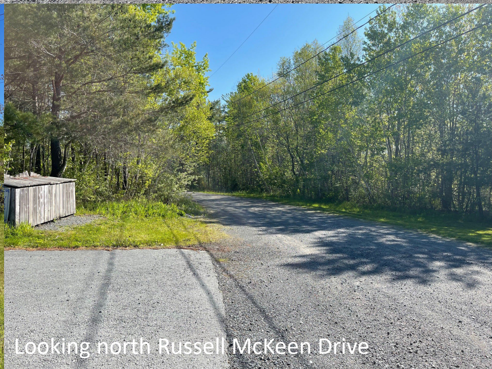
Looking north Russell McKeen Drive