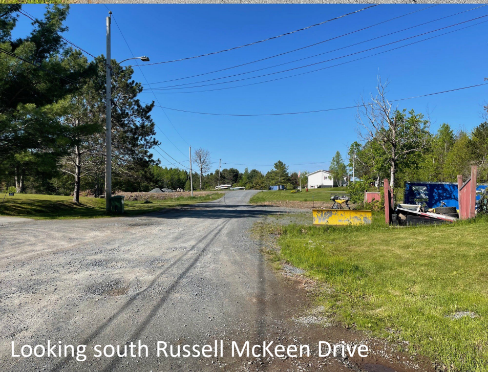
Looking south Russell McKeen Drive