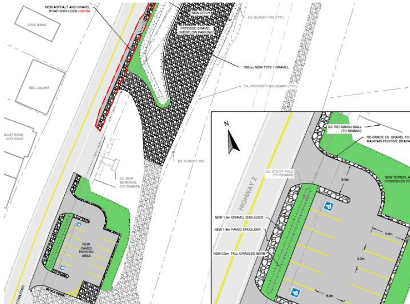
Shubenacadie Parking - Proposed Concept Plan - October 2024

In October 2024, Council received a staff report proposing the development of a public parking lot in the Shubenacadie Village Core to support future growth. Since many village lots are too small to provide their own parking, a shared public lot would make development easier and help the village core be vibrant and commercially active. The accompanying concept plan kept the cenotaph in its original location (see below - Shubenacadie Parking - Proposed Concept Plan - October 2024).