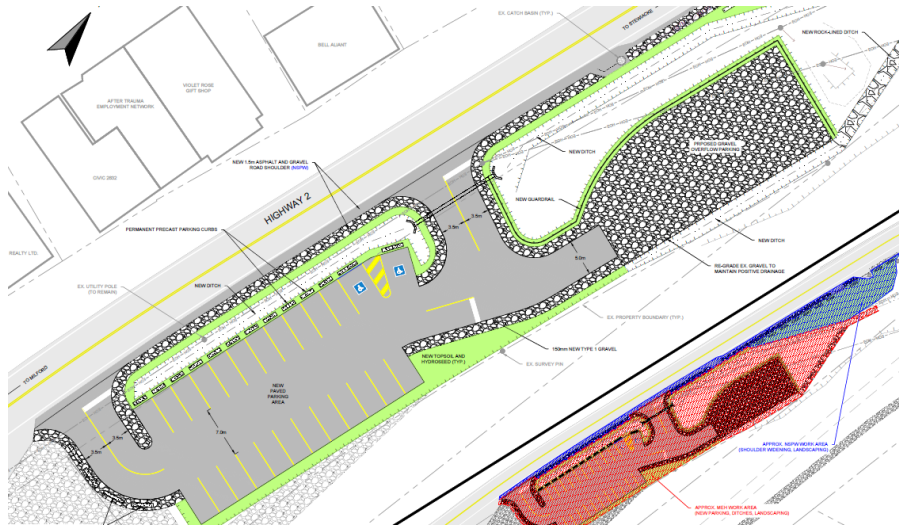
Shubenacadie Parking - Concept Plan - December 2024

In May 2025, the cenotaph was relocated to the front of the Shubenacadie Legion. In July, community members requested to present to Council as the group wanted to return the monument to its original location. The presentation was received at the July 23, 2025, Regular Meeting of Council.