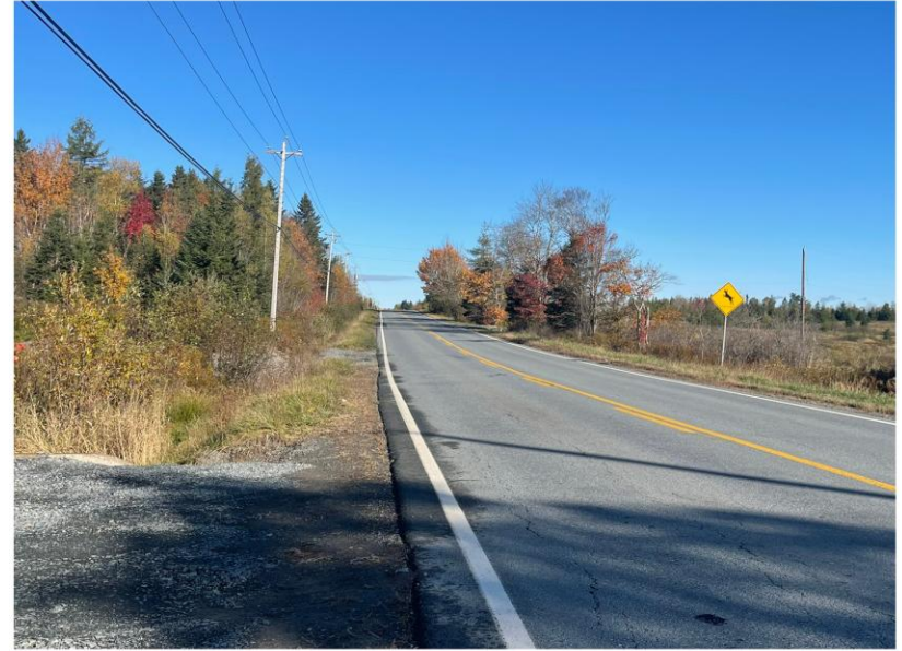
Looking north along Highway 214 from subject property.