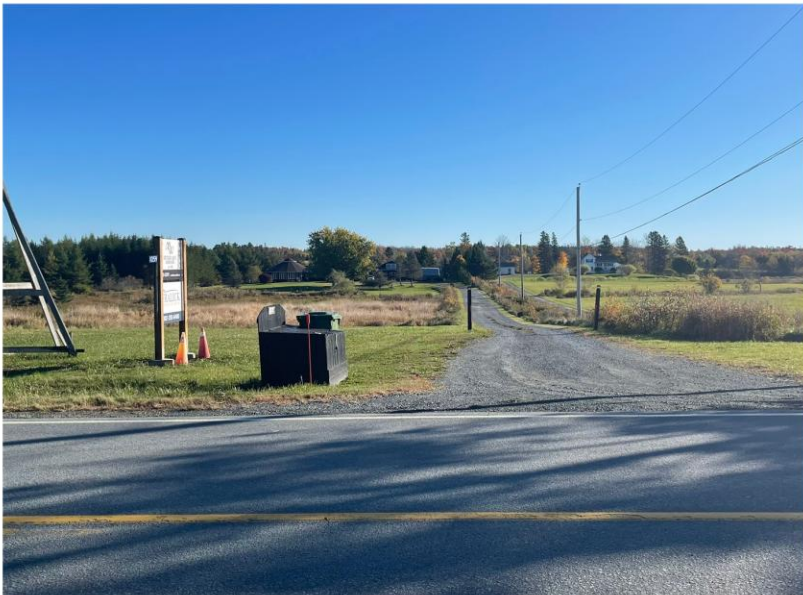
Property across the road from subject property.