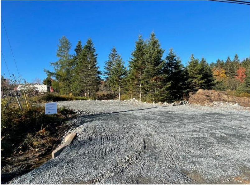
Entrance to subject property.