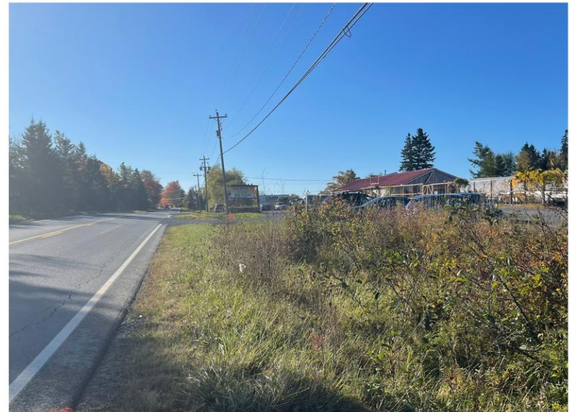
Looking south along Highway 214 from the subject property.