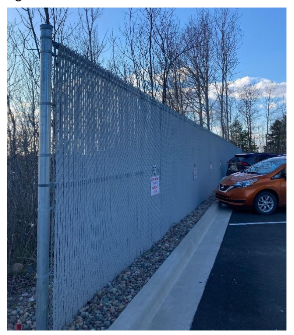
Figure 1 New fence.