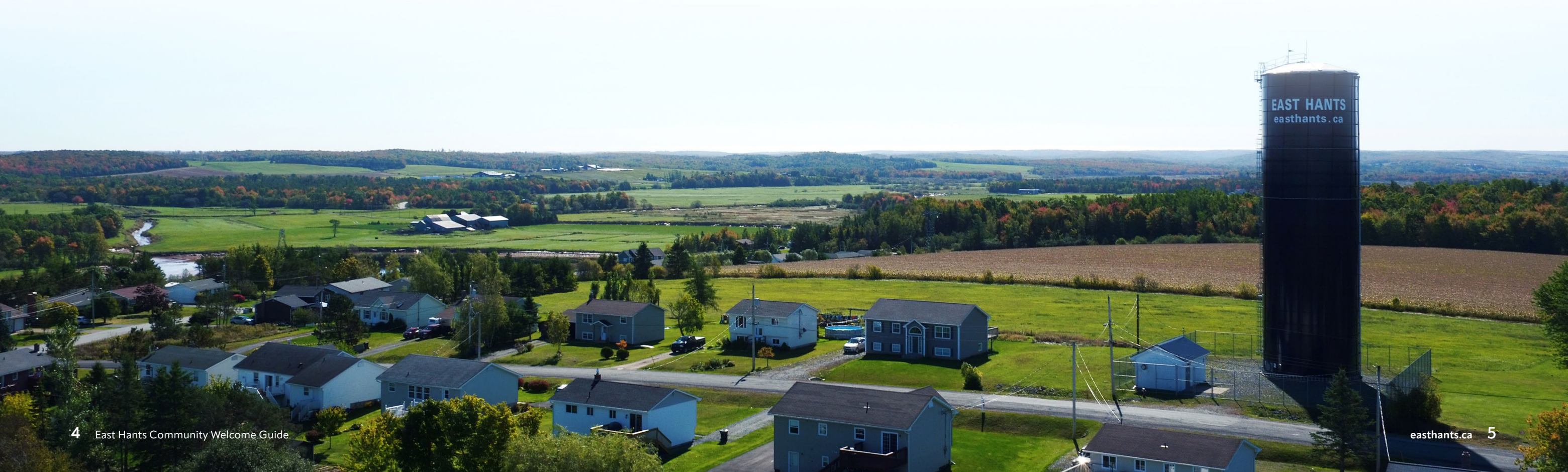
Shubenacadie, East Hants