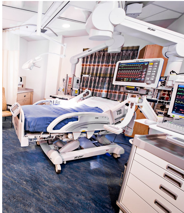
Colchester East Hants Health Centre, Truro

There is a growing demand for qualified healthcare workers, especially family physicians, in Nova Scotia. Through Nova Scotia Health, the province is actively working on a recruitment strategy. Physician and nurse recruitment is important to all Nova Scotians, and we look forward to welcoming new healthcare workers to our communities. The majority of East Hants falls within Nova Scotia Health's Northern Zone. However, some East Hants communities, like Mount Uniacke and parts of Enfield, are in the Nova Scotia Health's Central Zone. Locally, we have medical clinics located in Elmsdale, Kennetcook and Shubenacadie. Some of these clinics have collaborative family-practice teams, which are becoming popular throughout the province. For more information on practising medicine in East Hants, visit easthants.ca/practice-medicine to download our Physician Recruitment Guide.