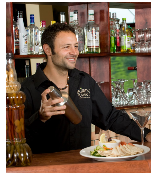
Bitar's Restaurant, Elmsdale

East Hants is also a vibrant place to live because of the strong local business community. There are numerous pharmacies and grocery stores to meet your everyday needs, as well as many local restaurants, coffee shops and spas to enjoy. You can also find city amenities just a short drive away in the province's capital of Halifax and its surrounding area.