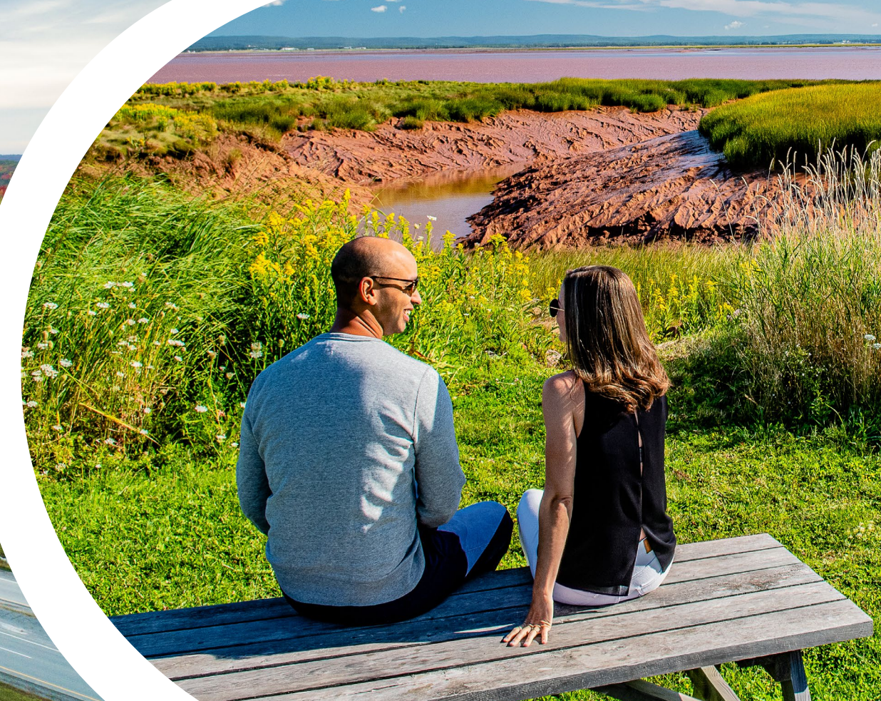
Shubenacadie River, Maitland