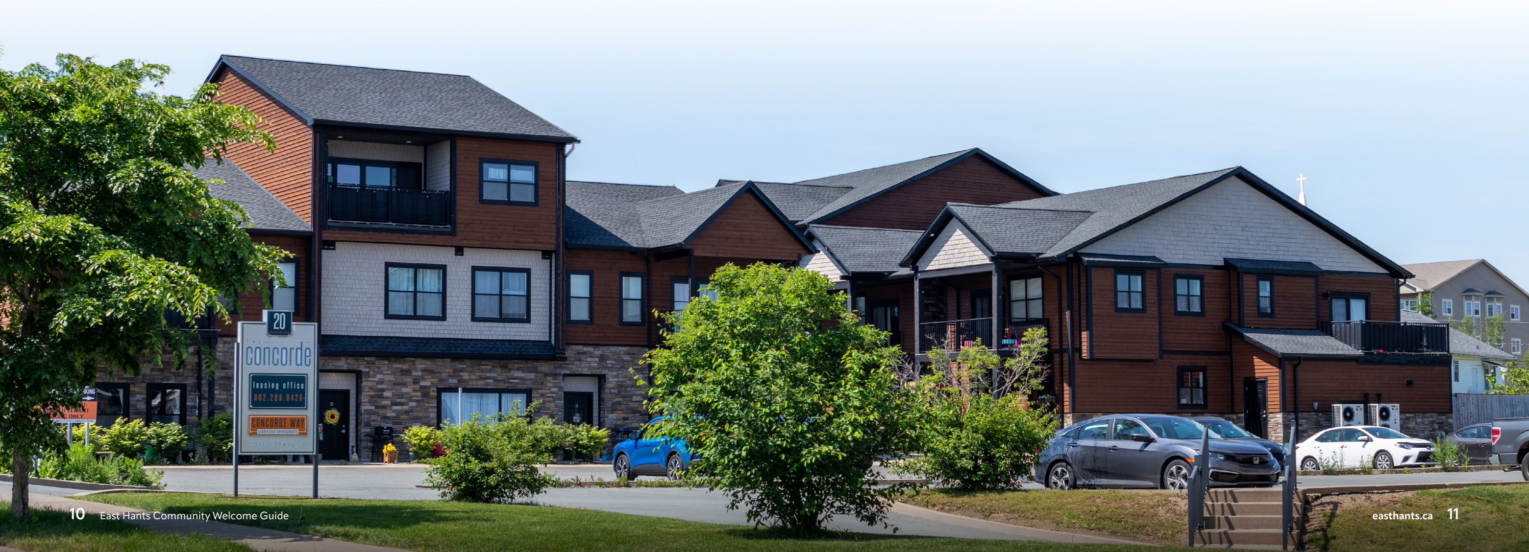
Concorde Way, Enfield

The East Hants region has home-care providers who will visit your home and help with personal care, medication, cleaning and other day-to-day activities. East Hants is also home to independent living complexes, seniors' apartment complexes, residential care facilities and nursing homes for those who need specific levels of care. Visit caregiversns.org or call 1-877-488-7390 to learn more about senior living options.