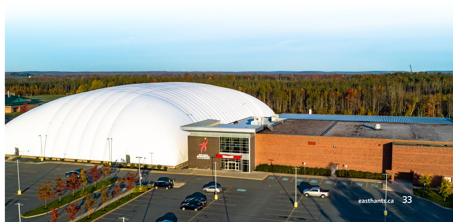
East Hants Sportsplex, Lantz

The East Hants Sportsplex also features a café and three community rooms that are available for rent. From late spring to early fall, the rinks are used for events, such as trade shows and craft fairs.