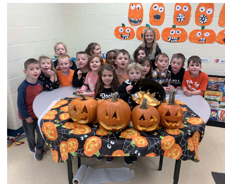
Primary Class, Maple Ridge Elementary School

Elementary schools across Nova Scotia offer a pre-primary program. This optional program allows families to access free, universal pre-primary education for one year before they enroll in primary. Children must be at least four years of age on or before December 31 of the year they enroll. Other child care options include licensed facilities and privatized daycares. An up-to-date list of licensed childcare facilities and more information on child care programming can be found online at childcarenovascotia.ca .