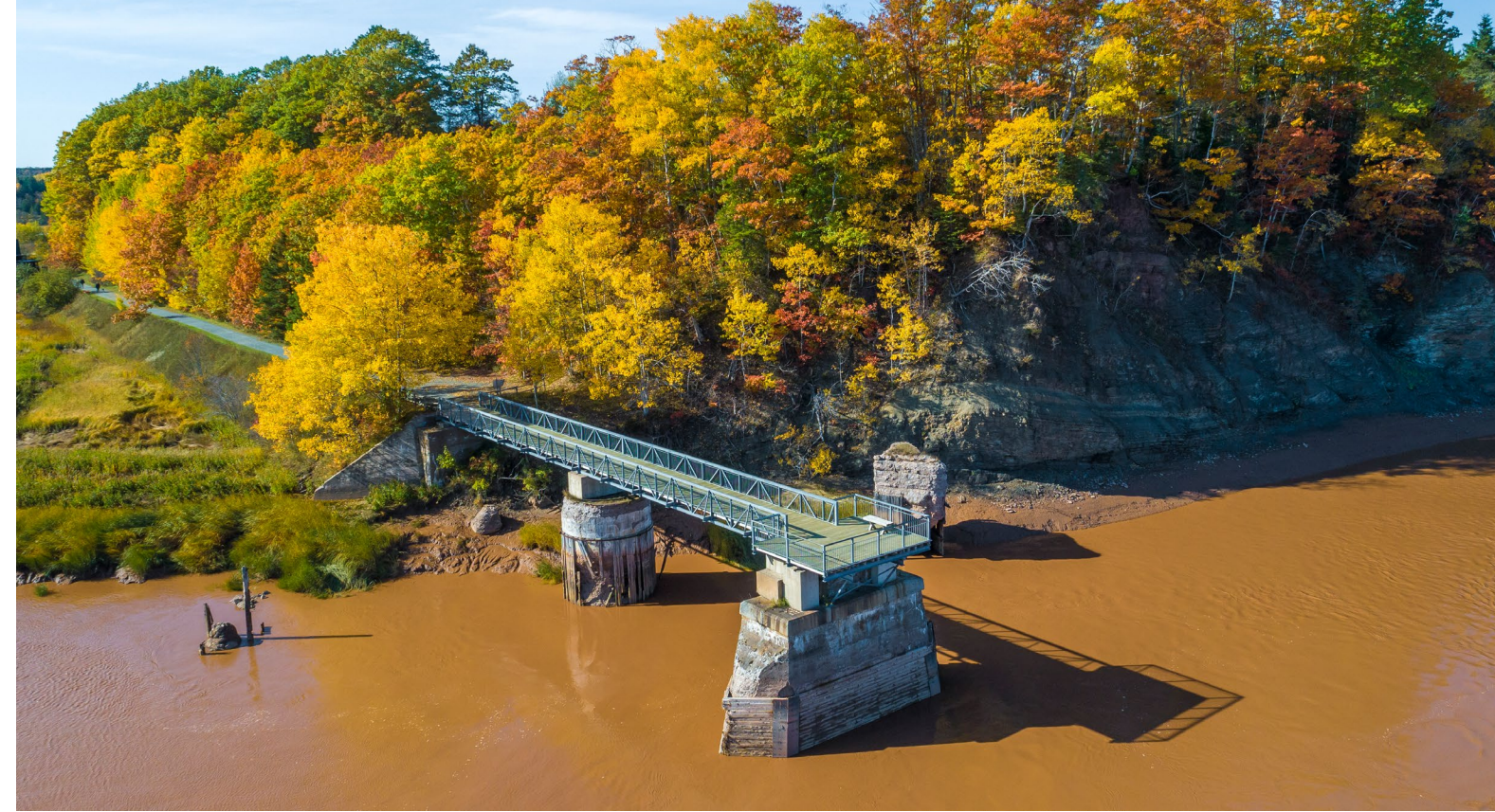
Fundy Tidal Interpretive Centre, Maitland

Spring in Nova Scotia is from mid-March to mid-June. Temperatures range from 0 to 10 degrees Celsius (32 to 50 degrees Fahrenheit) from mid-March to late April and from 10 to 20 degrees Celsius (50 to 70 degrees Fahrenheit) from late April to mid-June. In this season, nature