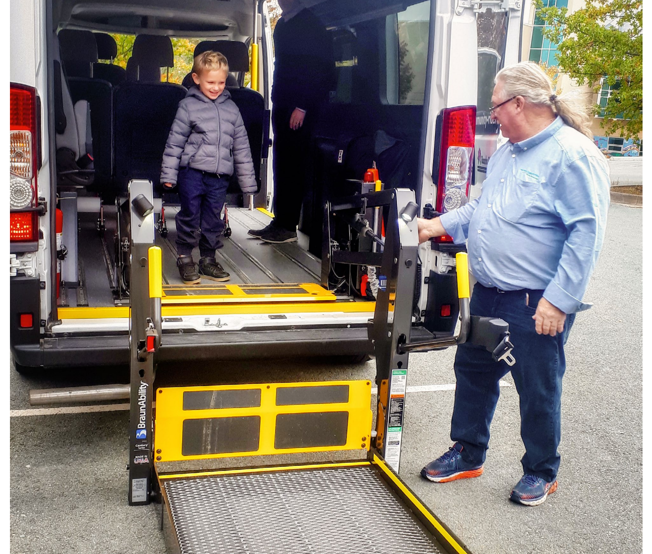
East Hants Community Rider, Elmsdale

In Nova Scotia, all new drivers must progress through the Graduated Driver Licensing system before they can get a regular driver's licence. The Graduated Driver Licensing system helps to reduce the risks that new drivers face, especially driving in a province with winter road conditions. There are three phases to the Graduated Drive Licensing program: Learner's Licence, Newly Licenced and the Restricted Individual. You'll need to pass a vision test, knowledge test and road test. This system is designed to give novice drivers plenty of hands-on experience before they drive independently with little to no restrictions.