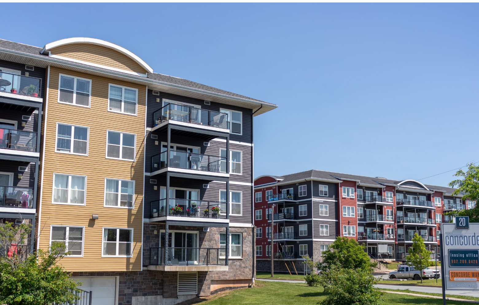
Concorde Way, Enfield