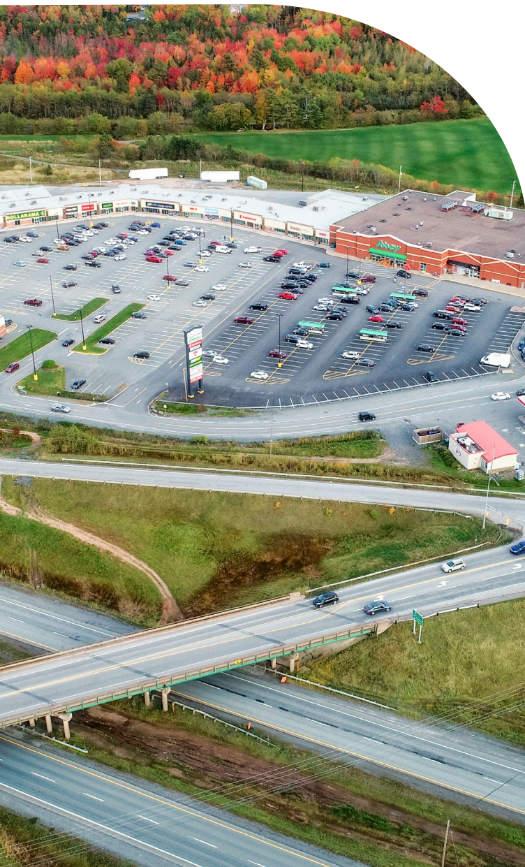
Elmsdale Shopping Centre, Elmsdale

In Nova Scotia you require a driver's licence to operate a motor vehicle on public roads and highways. Drivers are licensed according to the types of vehicles they are qualified to drive. As a result, there are several different types of Nova Scotia Driver's licences.