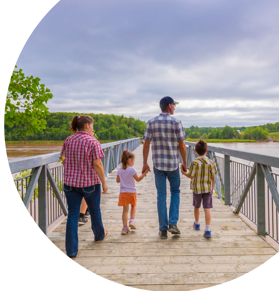
Fundy Tidal Interpretive Centre, Maitland

Both of these locations also offer 3D printing services for the creation of 3D objects such toys, jewelry, phone cases, home appliances and much more.