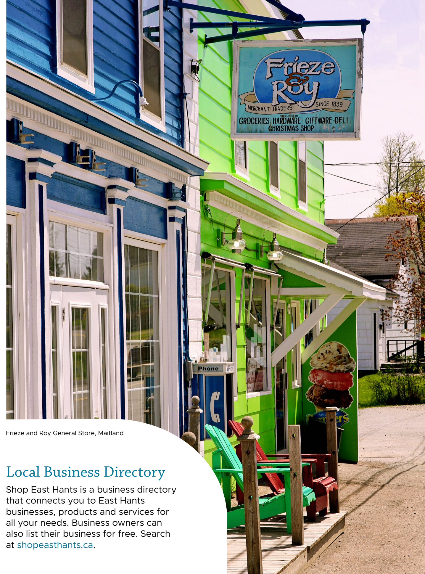
Frieze and Roy General Store, Maitland