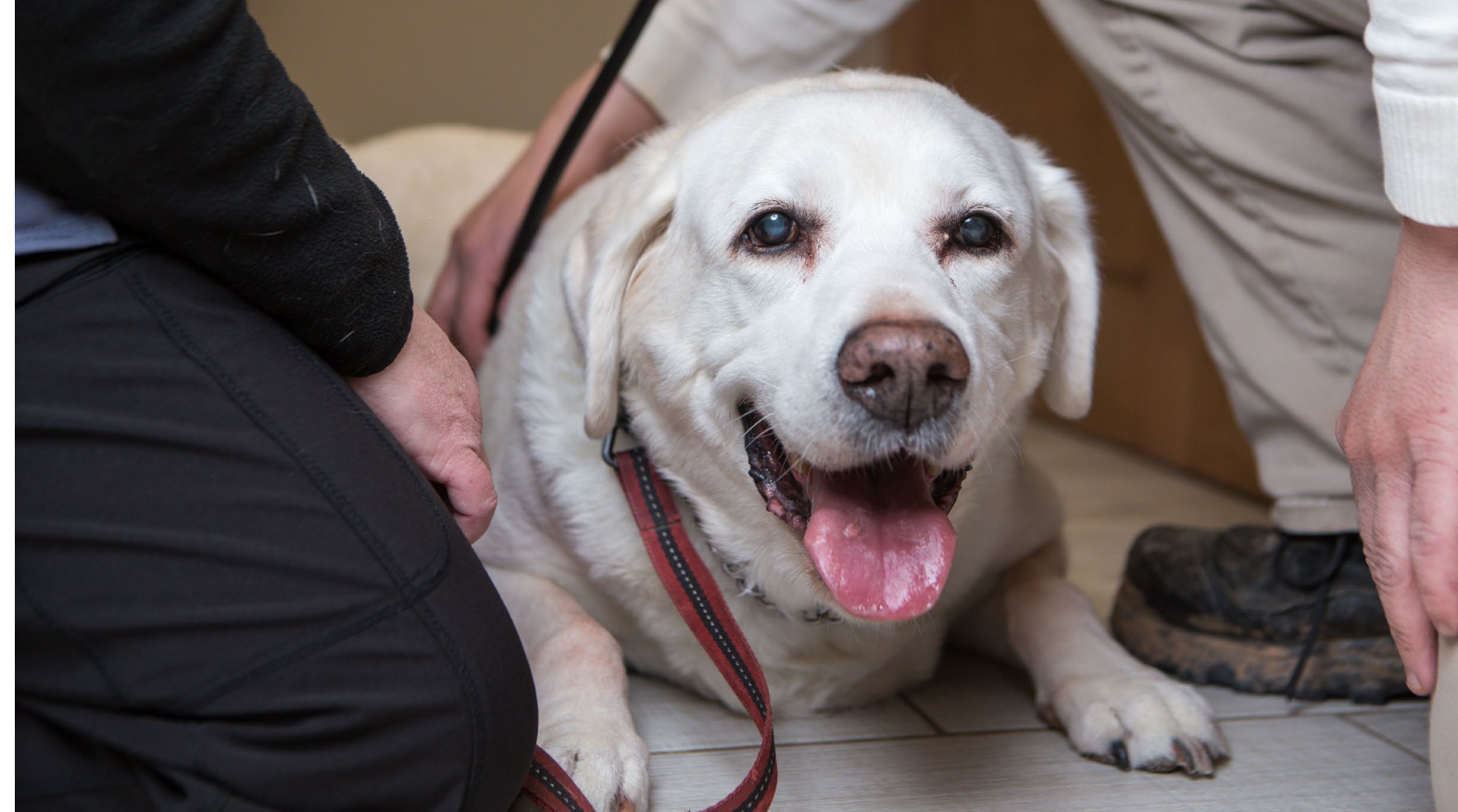
Courthouse Hill Farm, Kennetcook

21089 Highway 2, Shubenacadie, NS B0N 2H0 fundyvets.com