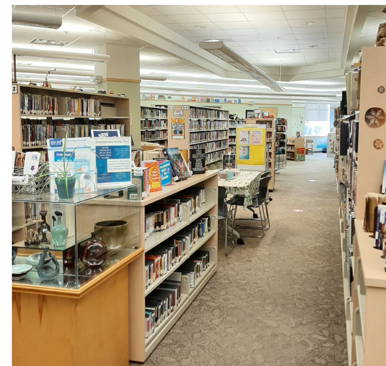
Colchester East Hants Public Library, Elmsdale