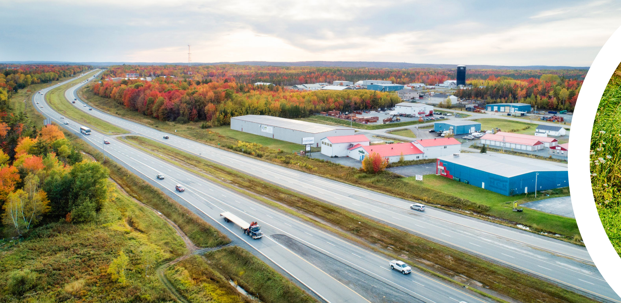
Highway 102, Elmsdale