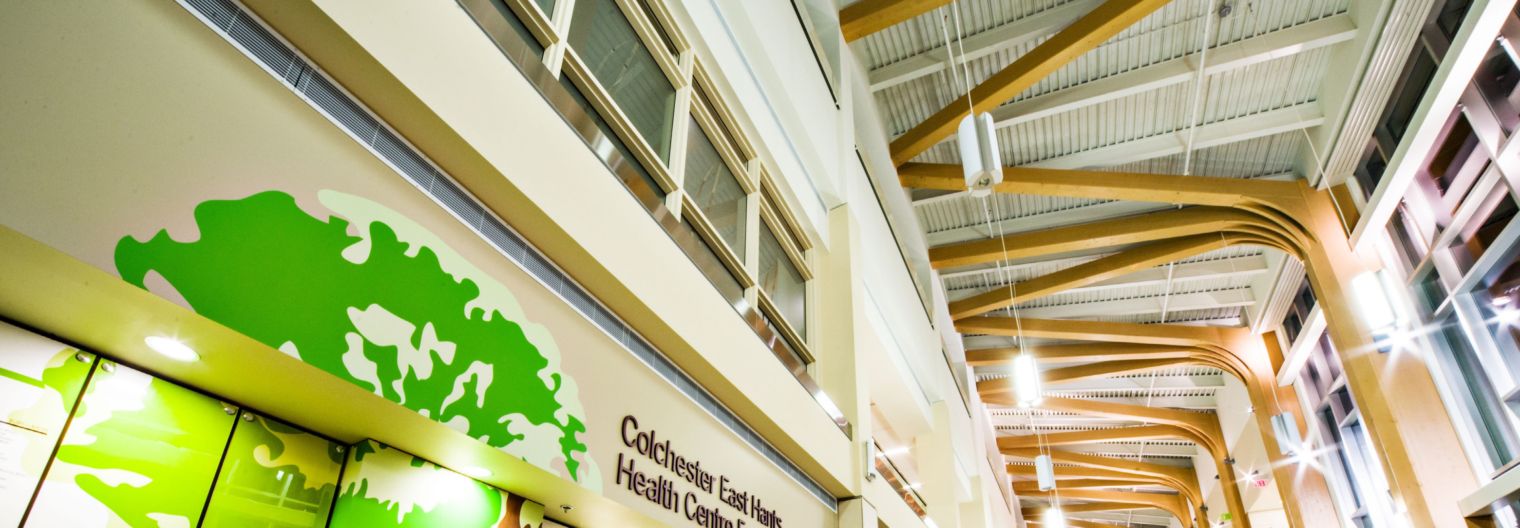
Colchester East Hants Health Centre, Truro