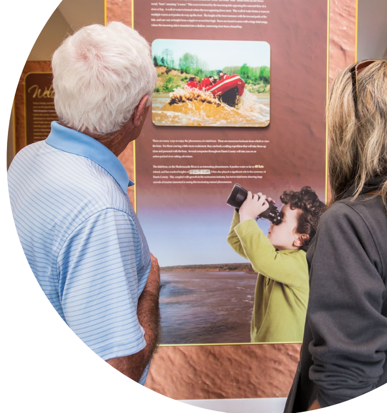
Fundy Tidal Interpretive Centre, Maitland