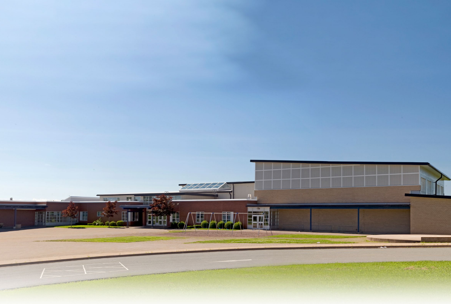
Riverside Education Centre, Milford