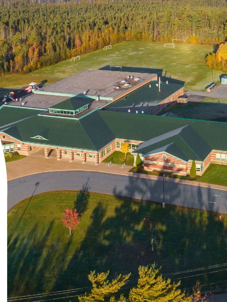
Maple Ridge Elementary School, Lantz