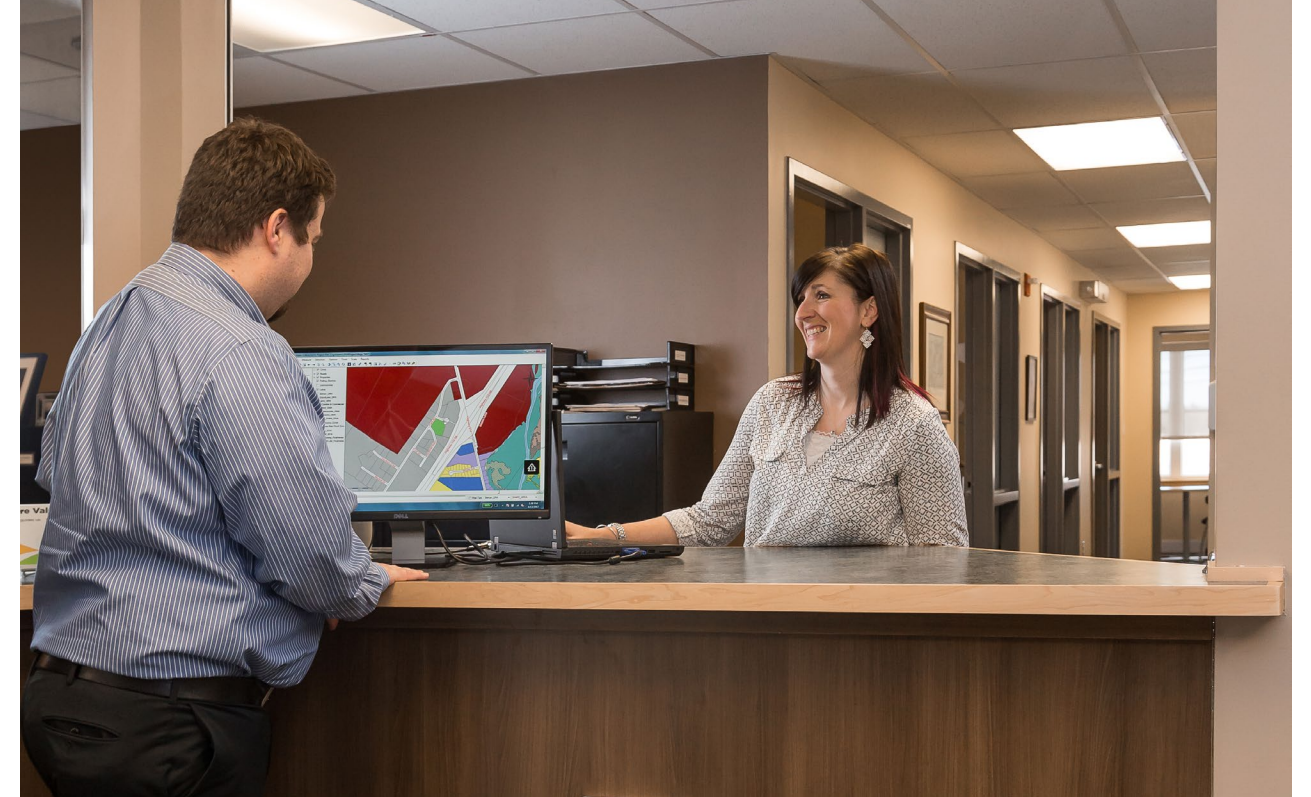
Municipality of East Hants Office, Lloyd E. Matheson Centre

General Inquiries: 902-883-2299 easthants.ca