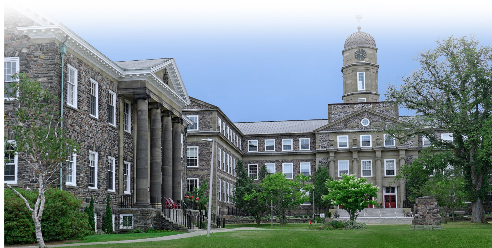
Dalhousie University, Halifax

The East Hants Community Learning Association offers a range of educational services to residents to encourage individual growth and help families reach their learning potential. Services include workplace education, educational programs and community programs such as family literacy, technology classes and senior safety. The East Hants Community Learning Association can also help you achieve high school equivalency through the General Educational Development (GED) program, upgrade employment-ready skills and improve literacy including learning English as a second language.