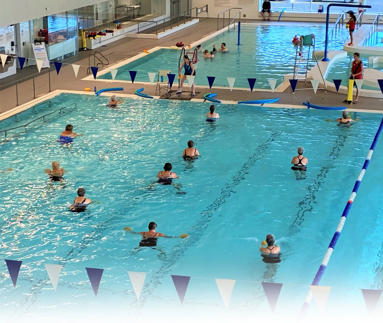
East Hants Aquatic Centre, Elmsdale