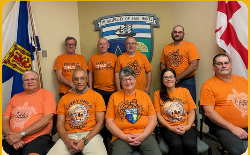
Pictured: East Hants Council wearing their Every Child Matters orange shirts to their September 2022 meeting in honour of Truth & Reconciliation Day.

September 30 is the National Day for Truth & Reconciliation. It is also known as Orange Shirt Day. The day honours the children who never returned home and Survivors of residential schools, as well as their families and communities. Shubenacadie was home to the only residential school in the Maritime provinces. The school closed in 1967.