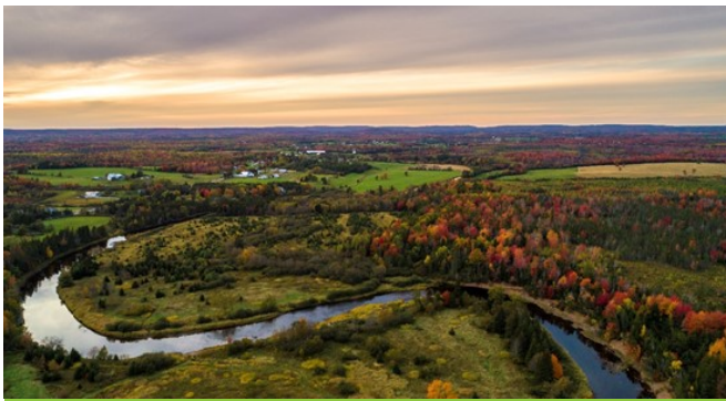
Nine Mile River

The East Hants Water Utility finished the year with a deficit of $121,122, against a $2.9 million budget. The Utility has 2,908 customers and an accumulated fund balance of $1,598,303.