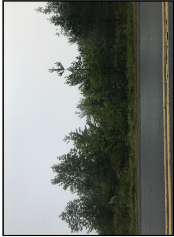
Looking across the street from subject property .