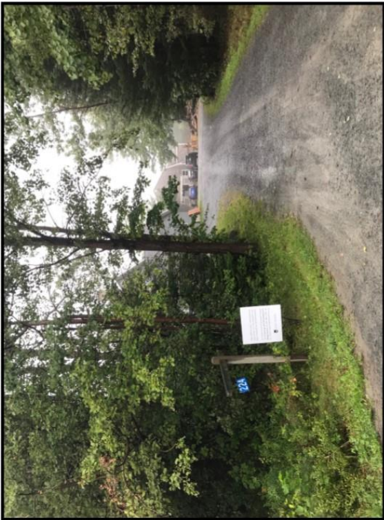
Subject Property .