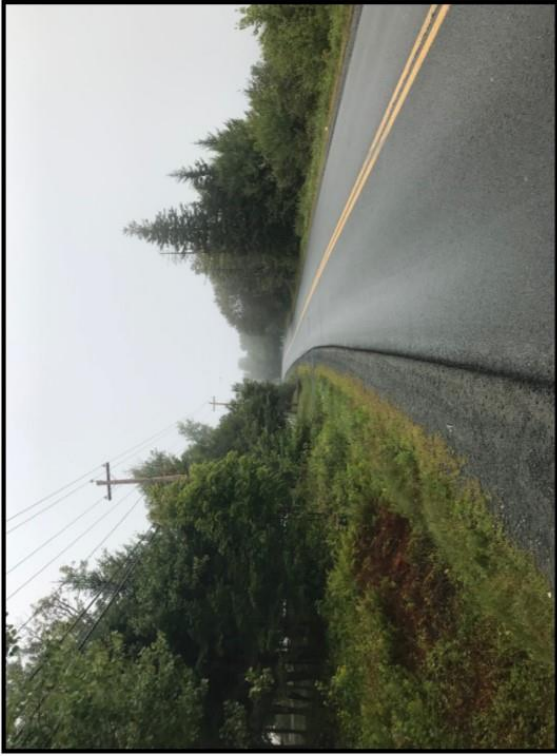
Looking north on Etter Road from the subject property .,