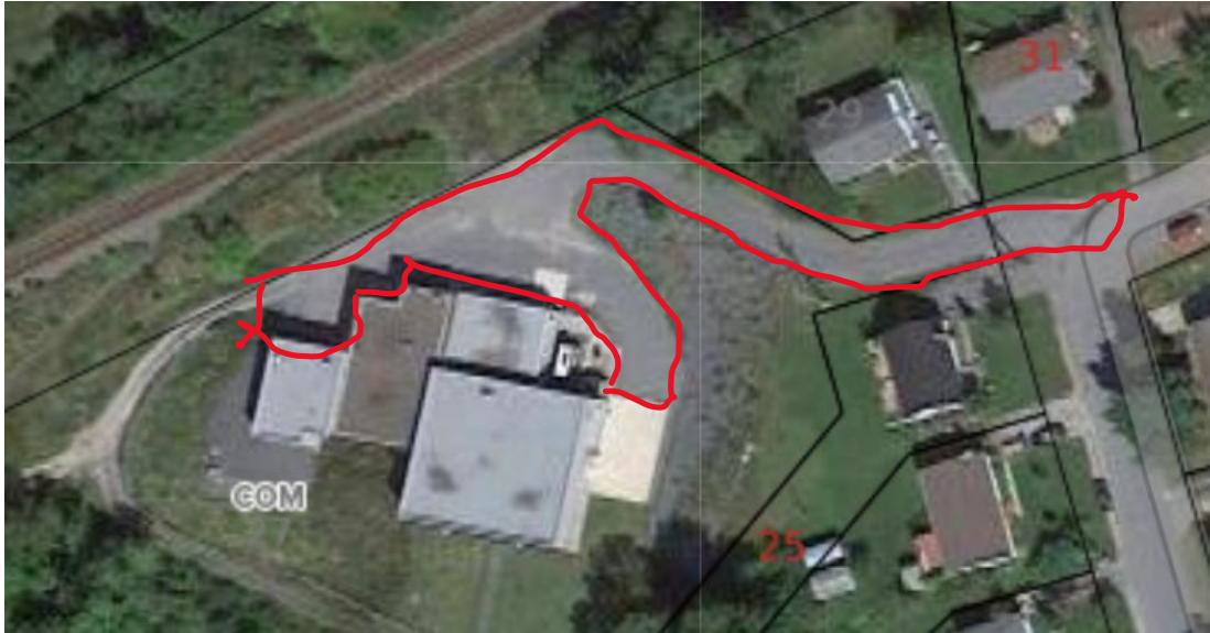
Bulk Water Station